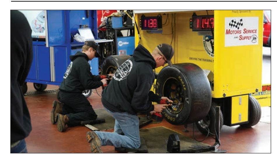
Program Showcase attendees participate in the pit stop challenge in a hands-on career exploration activity for Mid-State's Automotive Technician and Automotive Maintenance Technician programs during the fall 2023 event on the College's Wisconsin Rapids Campus.